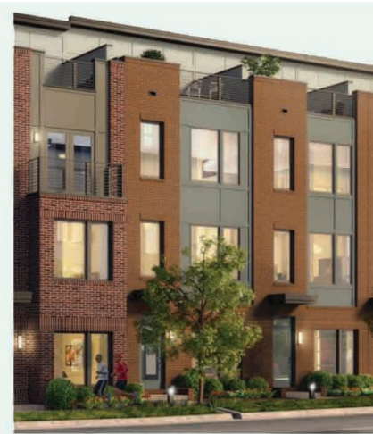
FEATURED EXTERIOR VIEW